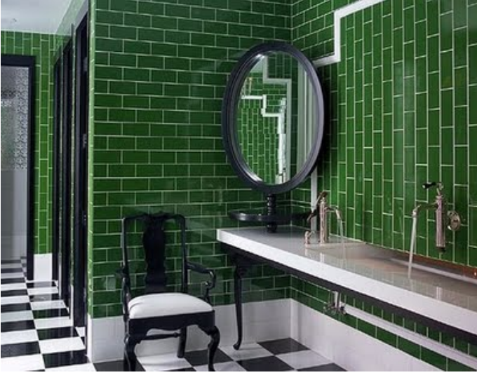
Three images above are from Modern Glamour: The Art of Unexpected Style , by Kelly Wearstler (Regan Books, 2004)

Kelly green is such a cheerful color, soothing yet vibrant and full of life. It can bring any interior palette to life. I have been using green for years and probably will for many more. One of my design projects from a few years back (pictured below) looks as fresh today as it was back then.