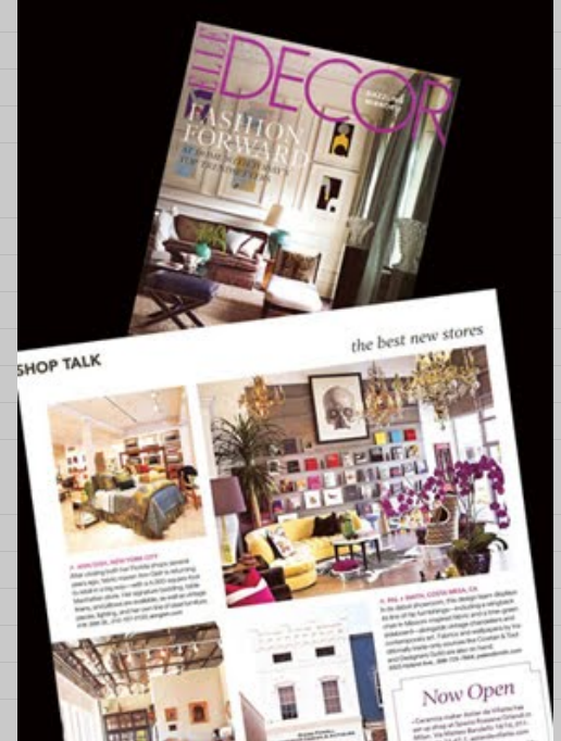
Pal+Smith in Elle Decor

I'm seeing green items, traditional and contemporary, in all of the magazines. This Samuel & Sons trim would liven up pillows or curtains.