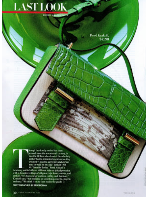
Vogue February 2013